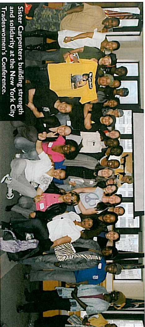
Sister Carpenters building strength and solidarity at the New York City Tradeswomen's Conference.

2009 NEW YORK CITY TRADESWOMEN'S CONFERENCE